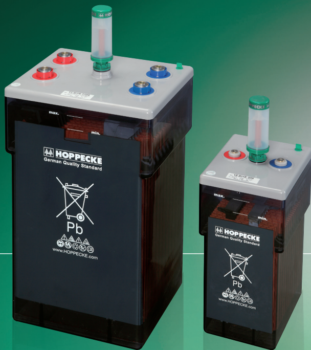
Similar to the illustration, AquaGen® optional